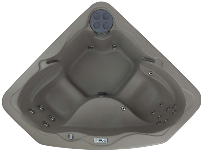
Tristar shown with Taupe shell