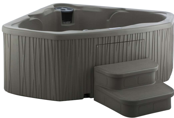
Tristar shown with Taupe shell