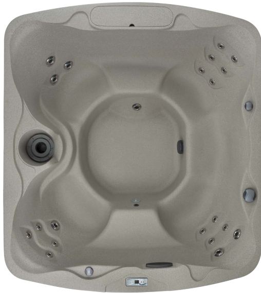
Monterey shown with Sand shell