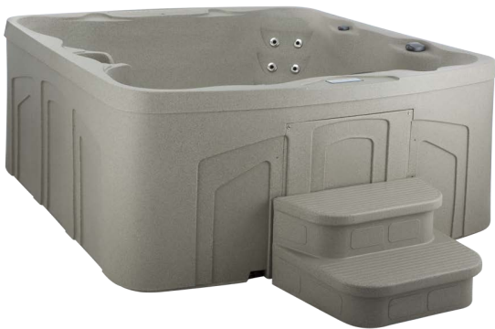
Monterey shown with Sand shell