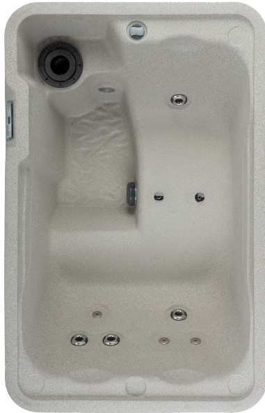
Mini shown with Sand shell