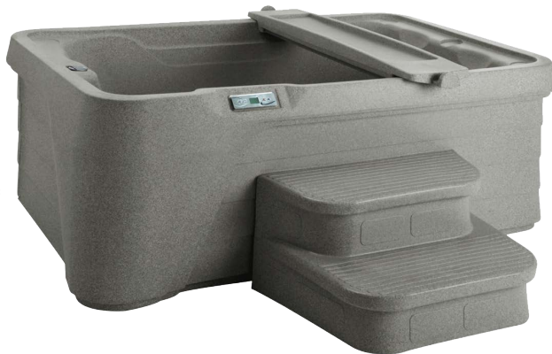
Mini shown with Sand shell