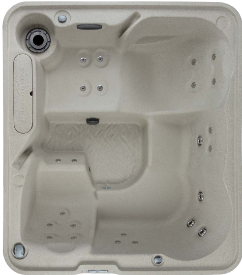
Excursion shown with Sand shell