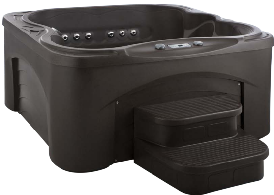
Cascina shown with Espresso shell