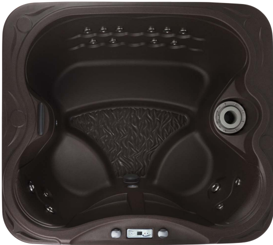
Cascina shown with Espresso shell