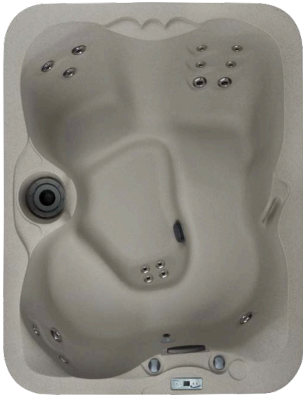
Azure shown with Sand shell