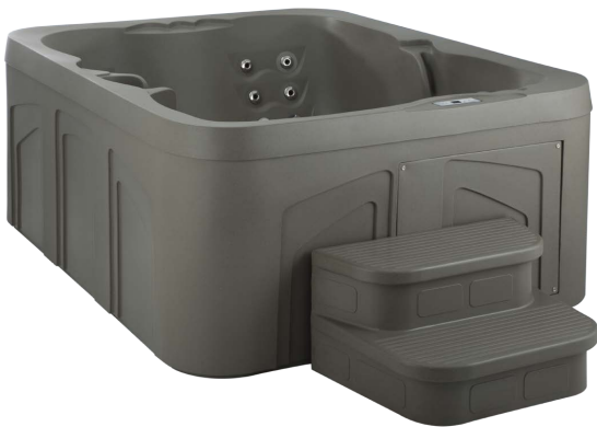
Azure shown with Taupe shell