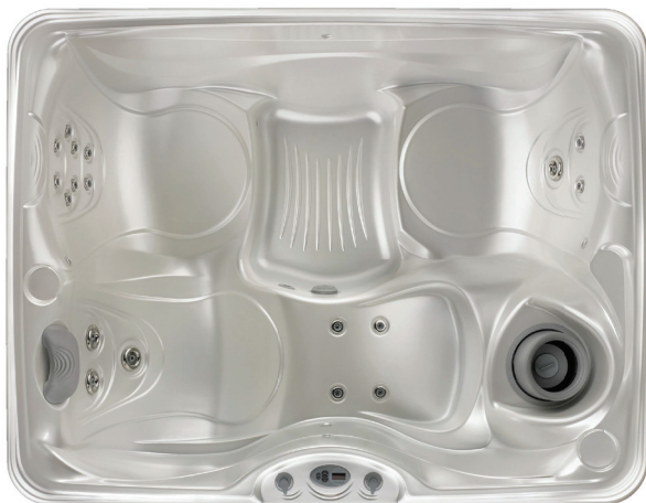
Stride shown with Pearl shell