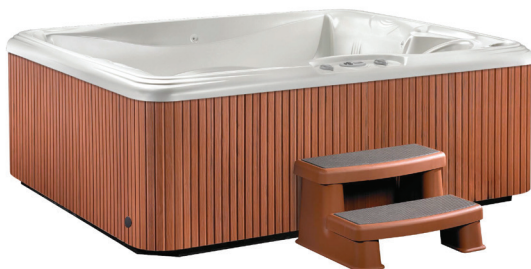
Stride shown with Pearl shell/ Redwood cabinet and Polymer step