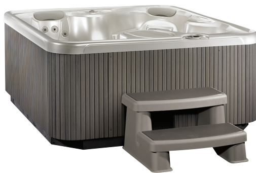
SX shown with Pearl shell/ Coastal Grey cabinet and Polymer step