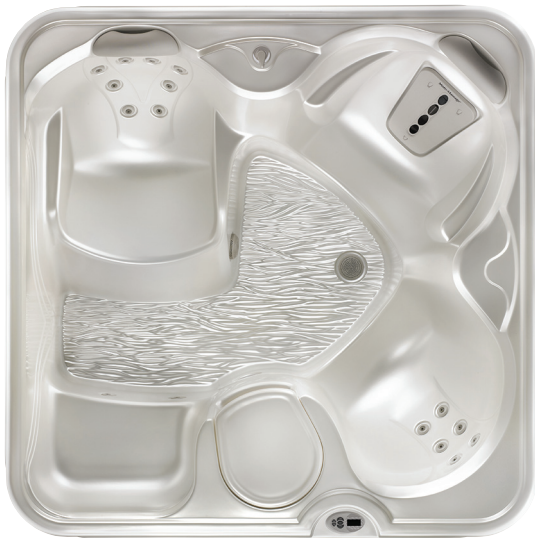
SX shown with Pearl shell